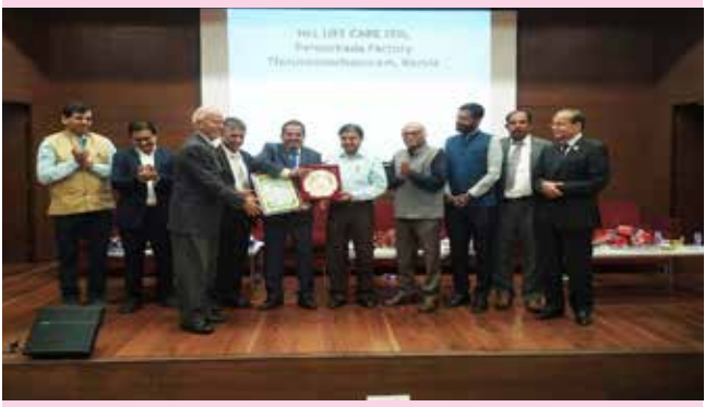
HLL, Thiruvananthapuram receives Quality Innovation Award 2024

HLL, Thiruvananthapuram received Quality Innovation Award 2024 from IEI Safety Quality Forum in Gandhinagar, Ahmedabad on 11.03.2024.