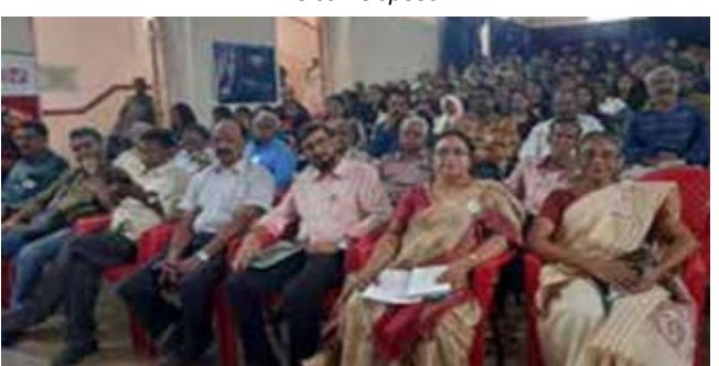
A view of Audience