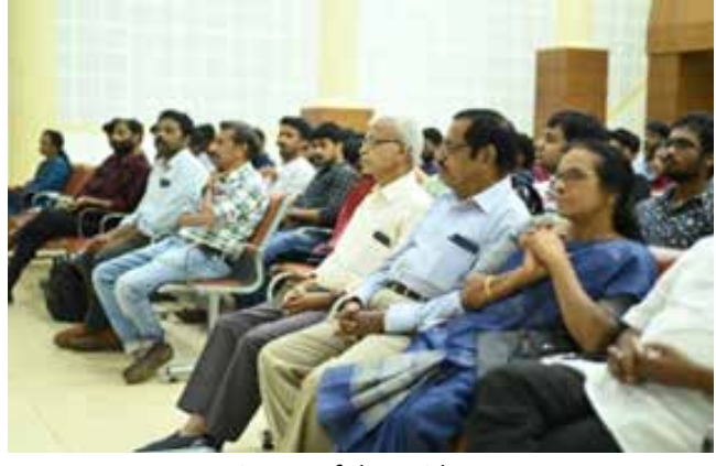
view -1 of the auidence