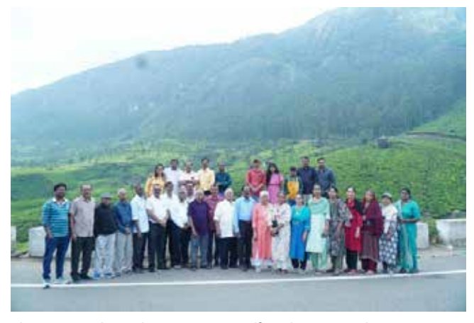
The visit to the Indo-Swiss Farm offered a unique learning experience, enhancing our understanding of cattle breeding and the farm's overall operations.

The Members of The Institution of Engineers (India) Kochi Local Centre, accompanied by their families, embarked on a technical visit to Mattupetty Indo-Swiss Farm in Munnar. The journey commenced at 7 am from Kochi Local Centre HQ. The Chairman and Hon. Secretary of the Kerala State Centre have joined the visit. Upon our arrival at the farm, officials from the Kerala Livestock Development Board conducted an informative session, shedding light on the farm's functions.